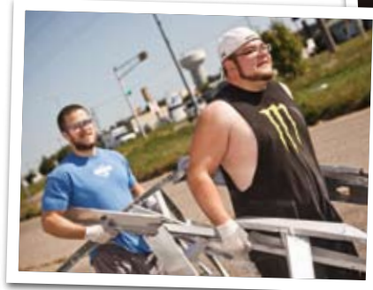
Volunteers helped start some of the Bargain Center Renewal projects this last Summer.