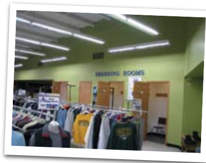
▲ New paint and lighting have been completed at the Bargain Center.

Phone 715-552-5566 to schedule a tour for yourself or your group.