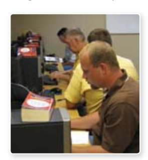
Residents studying in the computer lab

The courses we will offer include these work readiness courses: job applications and resumes, interviewing skills, and conflict resolution. Self development courses include personal finances and