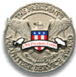
Silver 250 hours