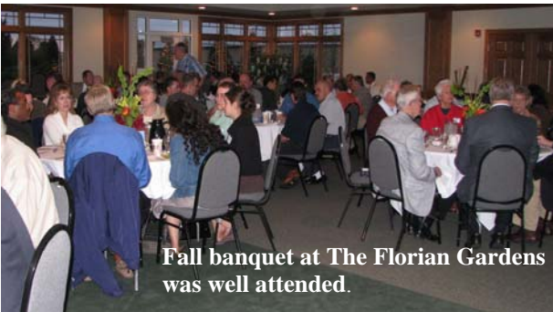
Fall banquet at The Florian Gardens was well attended.