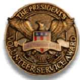
Bronze 100 hours