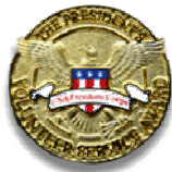
Gold 500 hours

Medals for volunteer service as referenced on the previous page